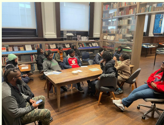
Image above: One of two groups of students from American History High School who visited the PRPL in early December and participated in a Newark narratives activity.

When you think of a research repository, what do you imagine? For some, the Library of Congress comes to mind, the Firestone Library at Princeton, or the NY Historical Society. Well, the reading room of the Philip Roth Personal Library (PRPL) does not embody the kind of archive which might come to mind immediately. Yes, we ask researchers to schedule appointments and to sign in when they arrive, and then we do proceed to explain the rules (photography of marginalia not permitted, please use pencil, no food allowed, etc.). However, who knows what might ensue after he or she gets situated with their piles of books. I probably shouldn't mention that during our last class tour in early December we served powdery beignets to the high school students in the reading room to thank them for their participation and attentiveness.