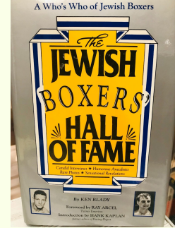
Image on the right: Roth's copy of The Jewish Boxers Hall of Fame (1988).

It's a gift to us that so many of Philip Roth's stories connect the reader to an imaginative, yet often real world of people living through hope and certain loss in the author's hometown of Newark.